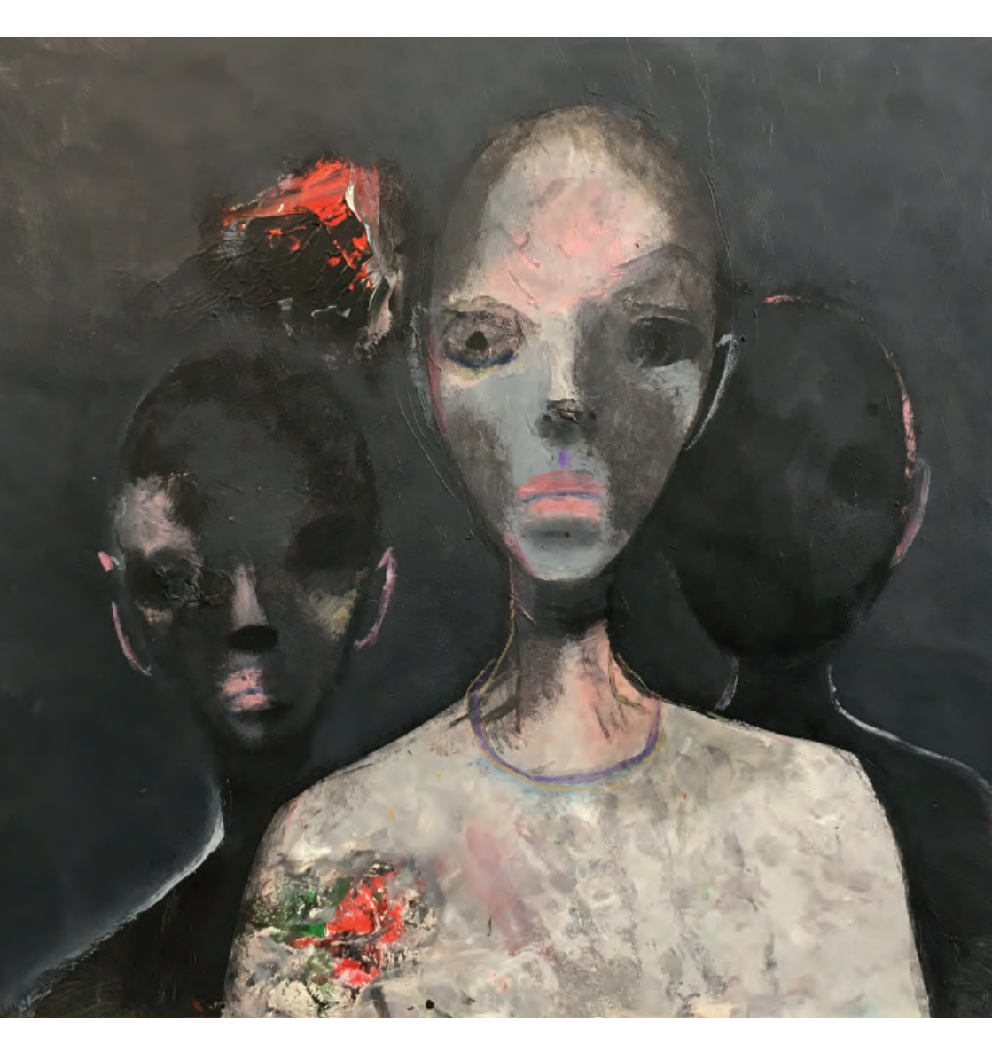
This painting, by artist Eddie Cahill, shows three female figures mourning the short lives of their sons, brothers and partners.