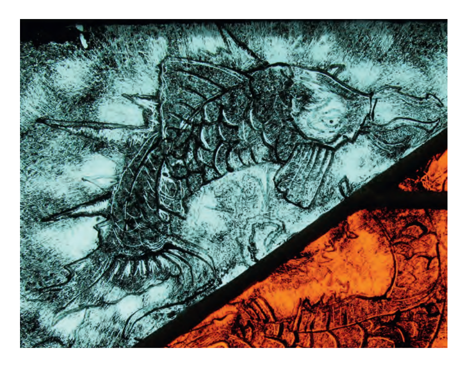
This is another detail from a panel featuring two fantasy fish created by an artist and illustrator who participated in the art education programme at Cork Prison.