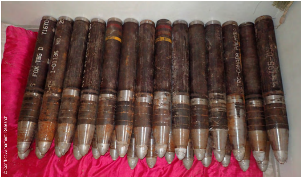
Improvised ground-to-ground rockets manufactured by IS forces and captured by Syrian Kurdish People's Protection Units in Kobane, documented by a Conflict Armament Research Field Investigation team on 21 February 2015 in Kobane.