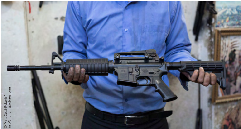
A Kurdish gunsmith holds a US-made M16A4, previously in the possession of the Iraqi army, and later IS, after the weapon was converted in to an M4 carbine-type rifle. Erbil, September 2014.

The main rifle type used by IS is the AK (Avtomat Kalashnikov) family of automatic rifles, as well as close copies and derivatives, with a bias towards the Russian and Chinese types that have been the staple of the Iraqi army for decades. Most of these weapons are decades old, though the more modern Russian AK-74M is in evidence, most probably looted from Syrian army stocks. IS forces have also captured US-manufactured small arms, including M16 assault rifles, along with Chinese, Croatian, Belgian and Austrian small arms. 9