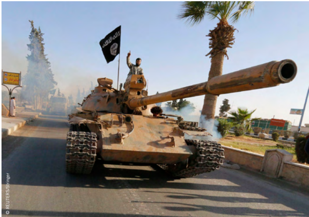
Islamic State fighters take part in a military parade in a captured T-55 tank along the streets of northern al-Raqqah province, Syria, 30 June 2014.

Additionally, during the current conflicts in Syria and Iraq, IS has captured hundreds of light armoured fighting vehicles of more than a dozen different types that were in service with the Syrian and Iraqi armies. However, the vast majority of light armoured fighting vehicles used by IS fighters comprise only a few models: the Russian BMP-1, MT-LB Infantry Fighting Vehicle, and the US M113A2 Armoured Personnel Carrier, M1117 Armoured Security Vehicle, and up-armoured HM-MWV (Humvee) variants.