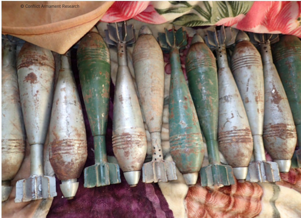
Improvised mortar rounds manufactured by IS forces and captured by Syrian Kurdish People's Protection Units documented by a Conflict Armament Research Field Investigation team on 21 February 2015 in Kobane.

IS captured an unknown quantity of 155mm M198 towed howitzers from Iraqi military stocks during its capture of Mosul in June 2014, along with the older Chinese Type 59-1, which the Iraqi army used extensively during the 1980-1988 Iran-Iraq war. 23 IS has also captured former Soviet Union D-30 and M-30 122mm howitzers from Syrian military stocks and small numbers of the older, and now obsolete, M-30 models which were probably taken from the Syrian army's reserve storage for deployment.